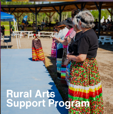
Rural Arts Support Program