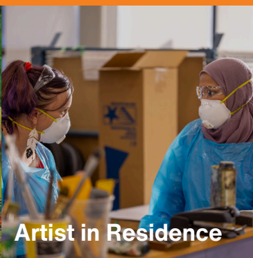
Artist in Residence