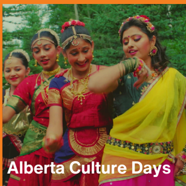
Alberta Culture Days