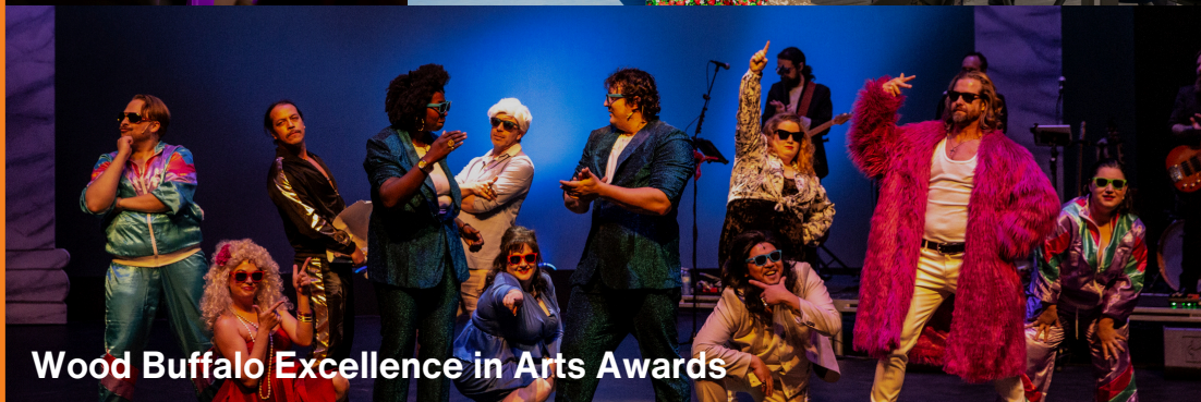
Wood Buffalo Excellence in Arts Awards

For an in-depth look at Arts Council Wood Buffalo's Programs, read our most recent Programs Report at www.artscouncilwb.ca/about-us .