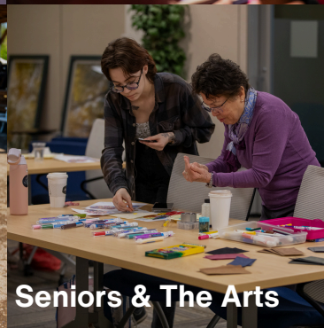
Seniors & The Arts