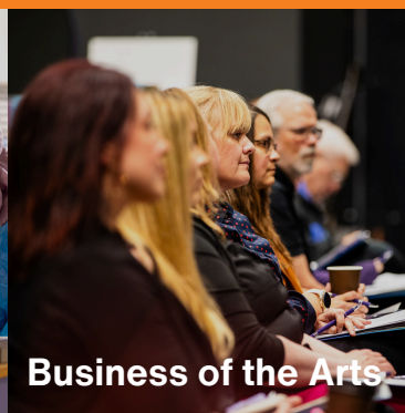
Business of the Arts