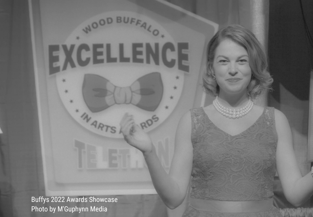
Buffys 2022 Awards Showcase