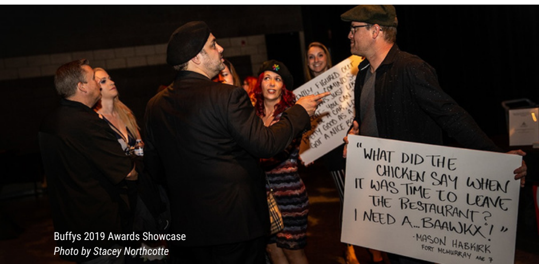
Buffys 2019 Awards Showcase