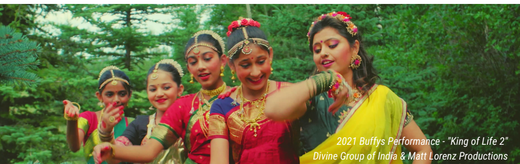
2021 Buffys Performance - "King of Life 2" Divine Group of India & Matt Lorenz Productions

You may only use a website (URL link) as support materials to direct adjudicators to one (1) particular sample of your work. Please do not link to a website overviewing all of your past work.